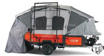
Aerial view with annex & roof rack installed