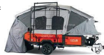
Aerial view with annexe & roof rack installed