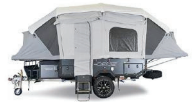
Aerial view with annex & roof rack installed